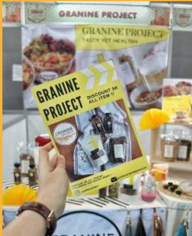
Bazaar @Grand Indonesia Shopping Center Feb 2018