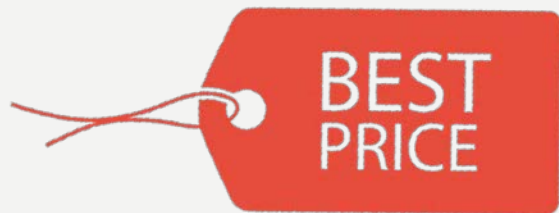
2 times Cheaper