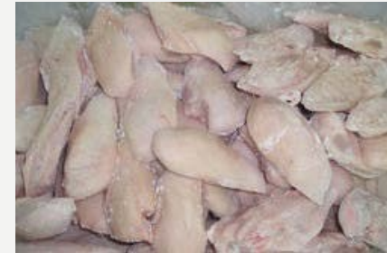
Frozen Raw Materials