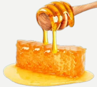
Healthy main sauce