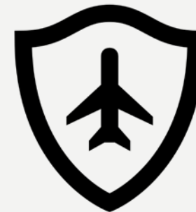
Auto Pilot System